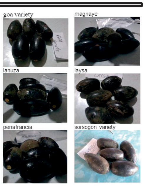
Fig. 2. Samples Used in Testing the Alternative Protocol.

It can be noted that generally, the color of pili fruit is black with purple characteristics. Some fruits are elongated and wide, while others are but small. Some elongated are rounded and short. The variety which was found bigger than the rest was Penafrancia and Goa followed by Magnaye and Laysa, Sorsogon and ever bearing varieties were noted to be smaller. Statistical test of significance on the average fruit mass however indicated that there are no significant differences in the size of the pili fruit samples used at .05 level of significance. It implied that visual