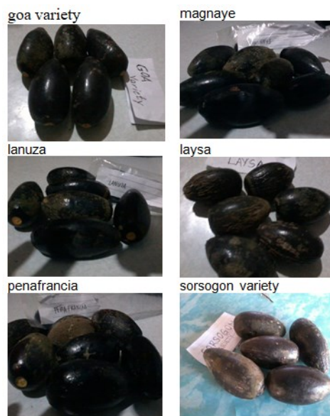
Fig. 2. Samples Used in Testing the Alternative Protocol.

It can be noted that generally, the color of pili fruit is black with purple characteristics. Some fruits are elongated and wide, while others are elongated but small. Some are rounded and short. The variety which was found bigger than the rest was Penafrancia and Goa followed by Magnaye and Laysa, Sorsogon and ever bearing varieties were noted to be smaller. Statistical test of significance on the average fruit mass however indicated that there are no significant differences in the size of the pili fruit samples used at .05 level of significance. It implied that visual